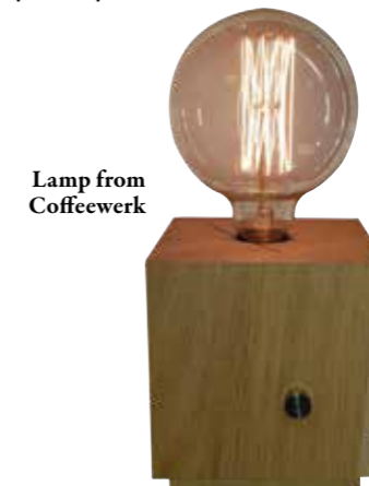
Lamp from Coffeewerk

Within both styles, one element is very common. Japanese and Nordic interiors rely heavily on natural elements such as