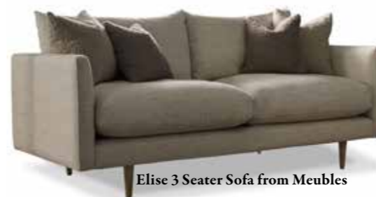
Elise 3 Seater Sofa from Meubles

Combining both aesthetics in your design allows you to bring home that