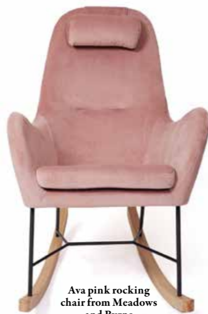
Ava pink rocking chair from Meadows and Byrne

Most Japandi room makeovers start with a darker base colour on the walls, usually a saturated, neutral shade. Balance is then created through combining a mix