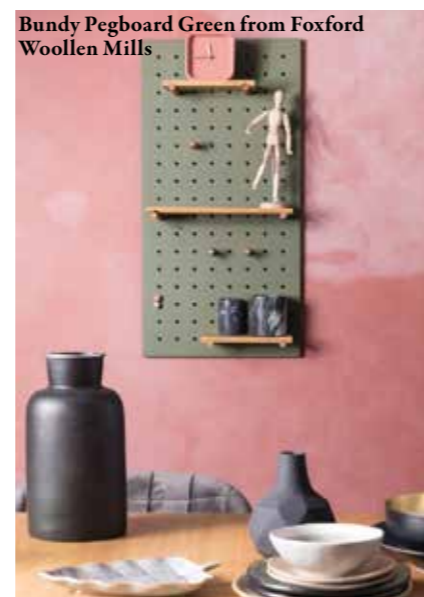
Bundy Pegboard Green from Foxford Woollen Mills

However, a few vivid colours can also be added through natural sources such as house plants. Japandi is the perfect common ground between the bright and cold colour scheme of Scandinavian style, and the warm and natural one from the Japanese. You may also find cooler hues of