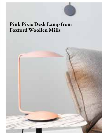
Pink Pixie Desk Lamp from Foxford Woollen Mills

plants to breathe a sense of energy into their décor. Be sure to include some plants into your Japandi interiors to inject some natural colour and bring the whole scheme together. Blurring indoor and outdoor is one of the foundations of this style and bringing green outdoor materials inside is the best way to achieve this. Choose tall plants with silky, delicate leaves and simple form, such as an orchid or peace lily.