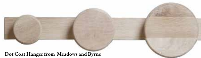
Dot Coat Hanger from Meadows and Byrne

muted pink, blues and green, warmed up with earthy details and wooden elements. Pops of colour should be introduced but always without distorting the minimalistic consistency of the design.