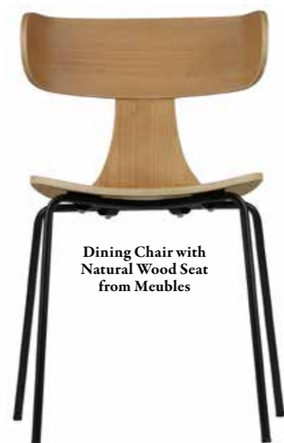
Dining Chair with Natural Wood Seat from Meubles

sense of both harmony and contrast. Mix your wood tones, incorporate pieces with both curved and straight lines and achieve