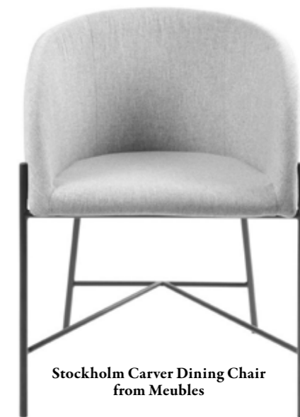
Stockholm Carver Dining Chair from Meubles

plants to breathe a sense of energy into their décor. Be sure to include some plants into your Japandi interiors to inject some natural colour and bring the whole scheme together. Blurring indoor and outdoor is one of the foundations of this style and bringing green outdoor materials inside is the best way to achieve this. Choose tall plants with silky, delicate leaves and simple form, such as an orchid or peace lily.