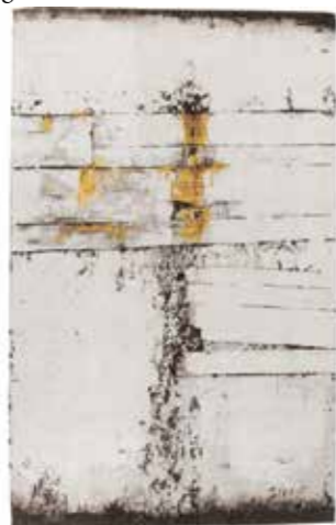
Abstract Grey Line Rug from EZ Living Furniture

It's the differences between the two styles that help make this mash-up particularly interesting. While Japanese spaces run the risk of being too minimal and sleek, the rustic details in Nordic design add variety. Where Scandinavian interiors tend to be highly neutral, the rich colour palette of Japanese design gives the room a cosy glow.