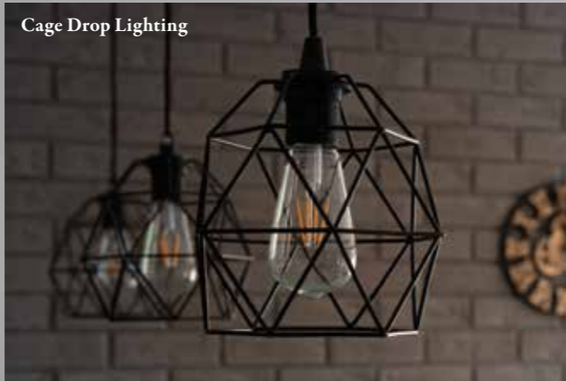
Cage Drop Lighting