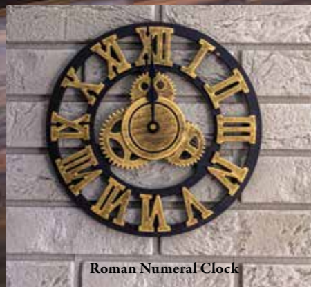
Roman Numeral Clock