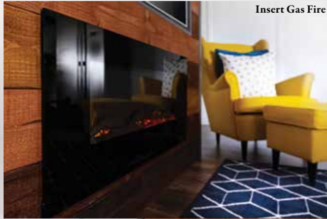
Insert Gas Fire